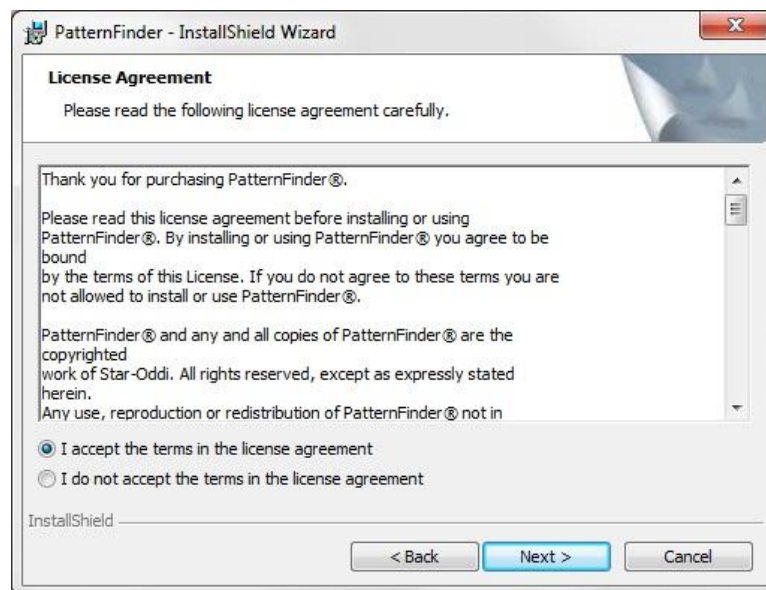
Figure 1 License Agreement

The user will be asked to accept the License Agreement