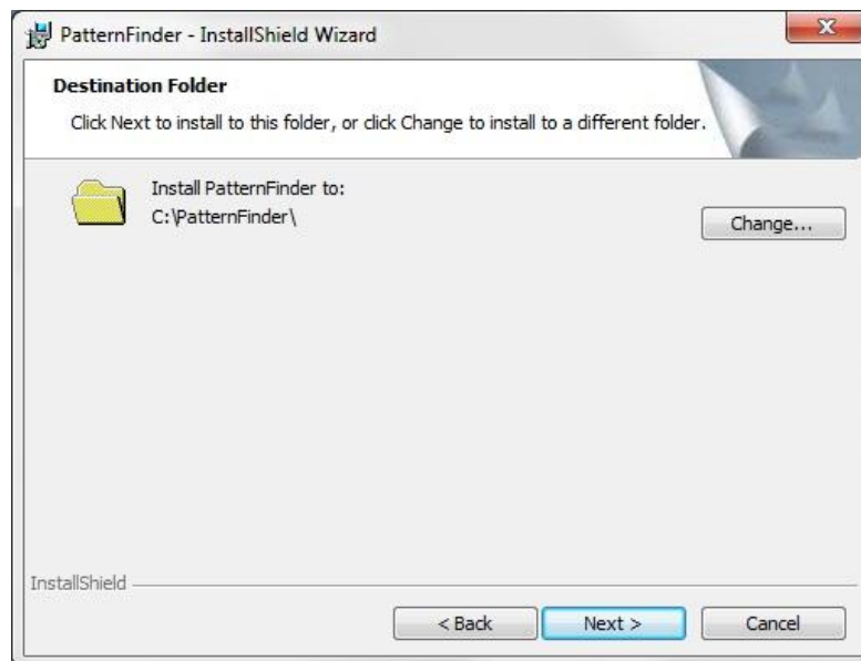
Figure 2 Destination Folder

The user will be prompted for a directory name for the PatternFinder program.